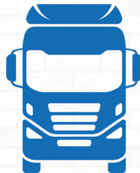
TRUCKING SECURITY REQUIREMENTS